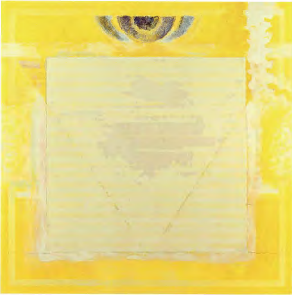
"Landscape", 1986–87, acrylic on canvas, 48×48"

Front Cover: Lover's House , 1987, mixed media on canvas, 13×13" Printed in Switzerland by Stämpfli + Cie AG, Bern