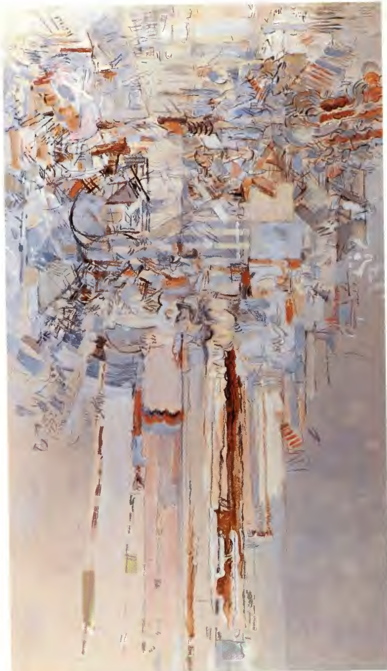
NEW YORK I, 1987, acrylic on canvas, 72 × 41"