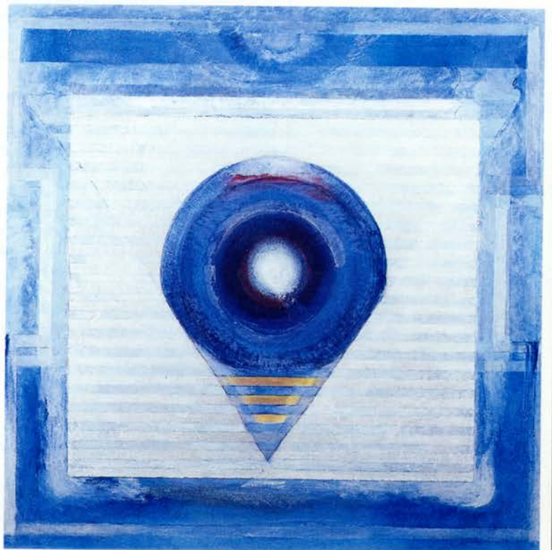
Luise Kaish, New York , 1986-87. Mixed media on canvas, 48 x 48" .