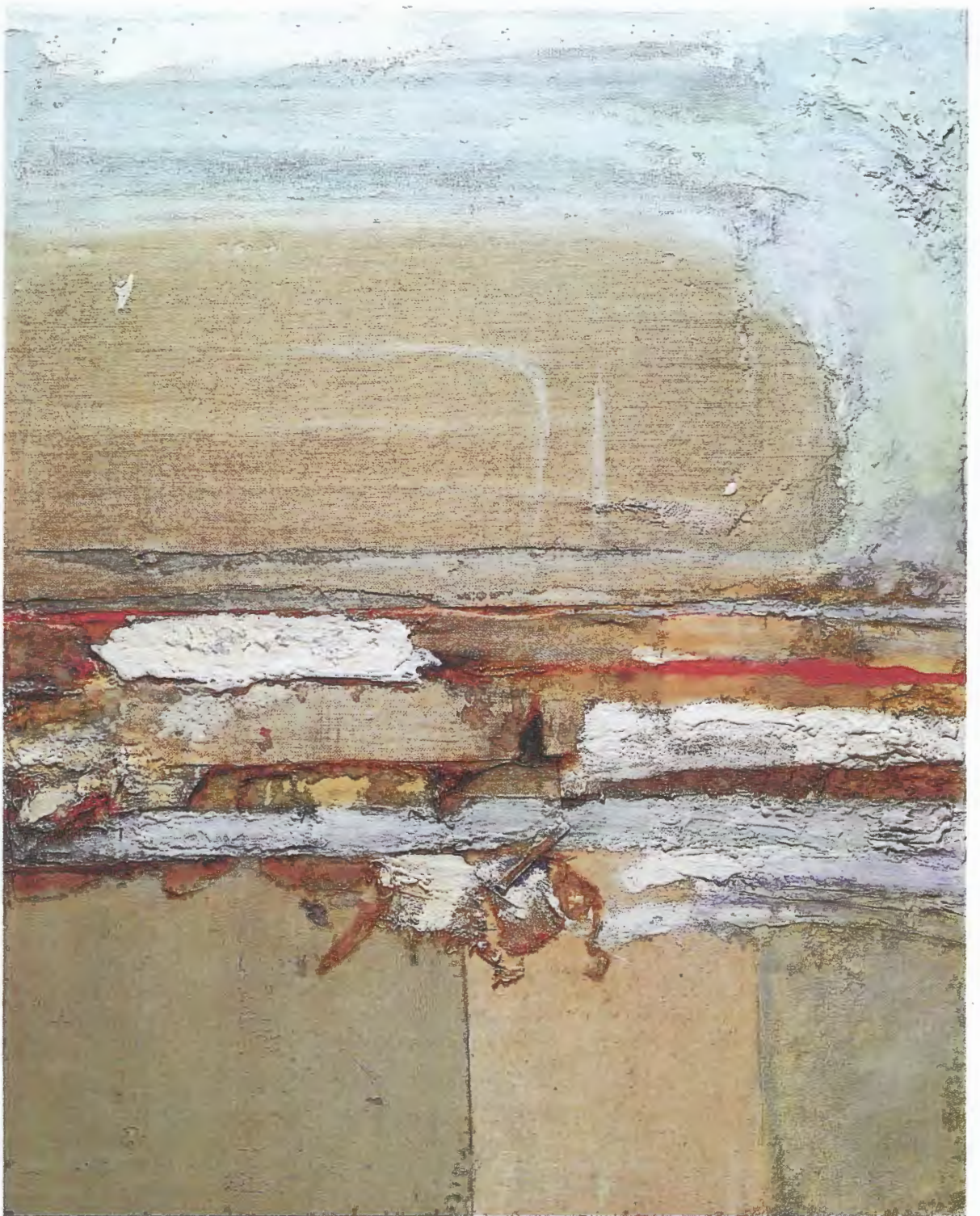
Glacier Bay I , 1983, mixed media on canvas, 20 \frac{3}{8} × 16 \frac{1}{4} "