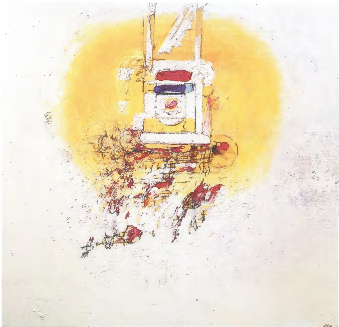
Portal II , 1983–84, mixed media on canvas, 26 \frac{3}{4} × 26"