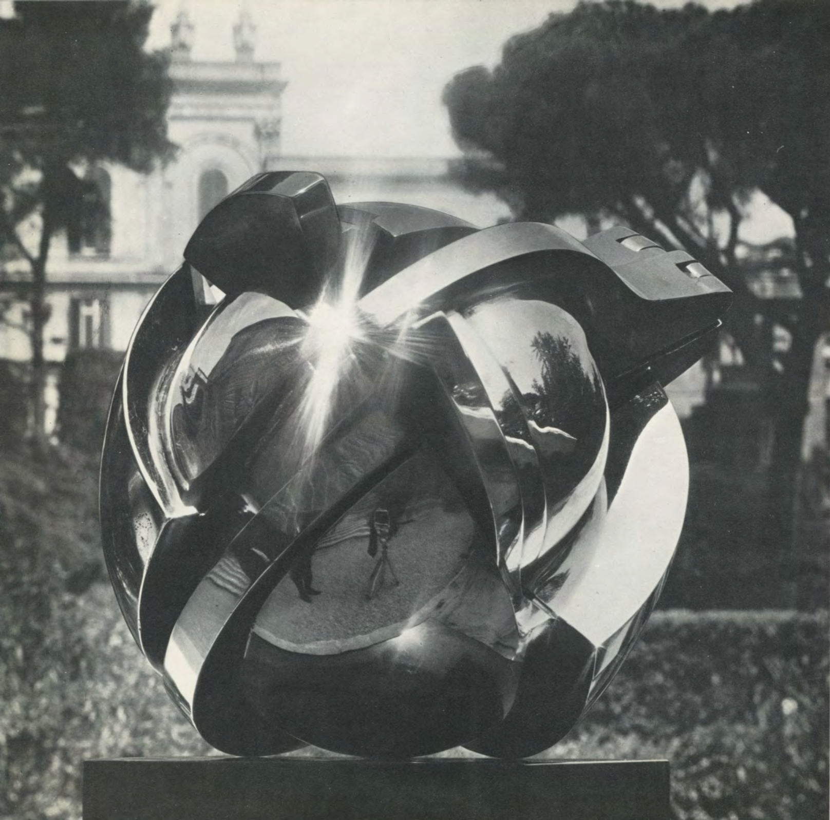
IN THE BEGINNING IV, Bronze, 10" h. X 11" w. (closed), Evolutions