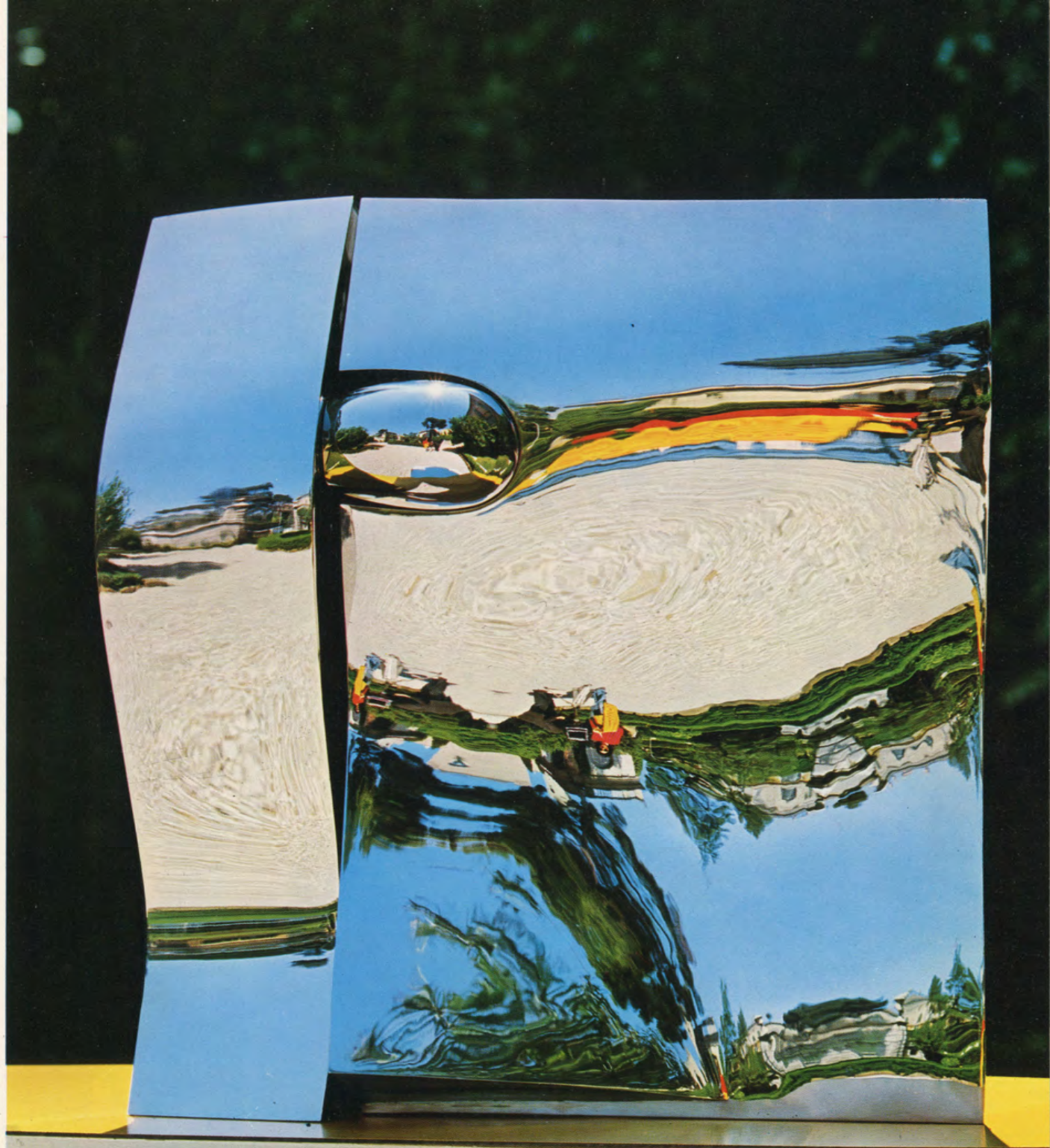
VOYAGE II Stainless Steel, 22" h. x 21" w.