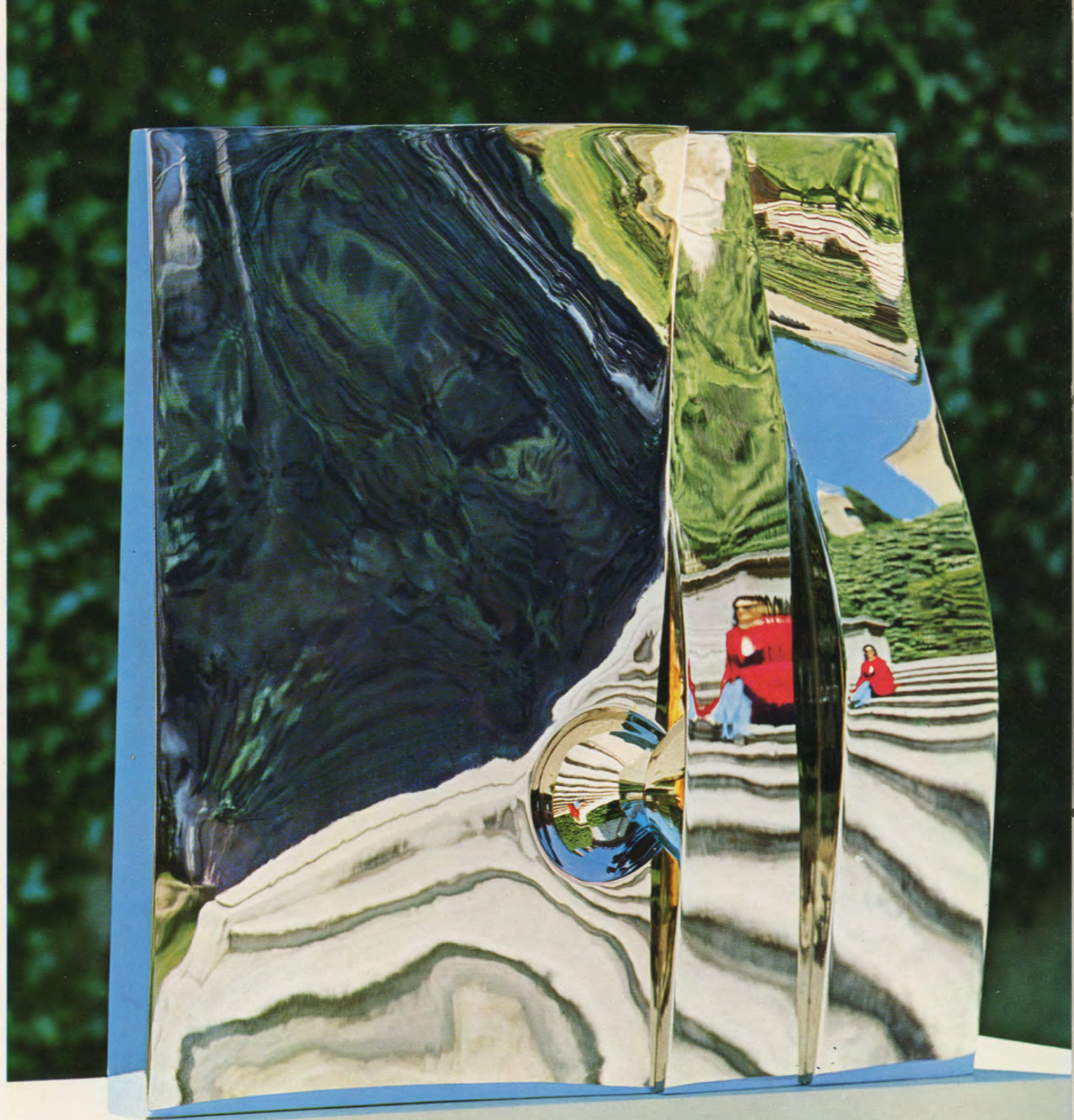
VOYAGE I Stainless Steel, 29" h. x 29" w.